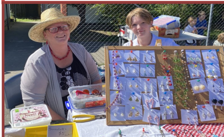
Primary Christmas Concert Years 1-6

NB: If your email, caregiver details, address, phone numbers, circumstances, etc have changed over the last few months please let the school office staff know asap. admin@rnls.school.nz or 03 313 6332.