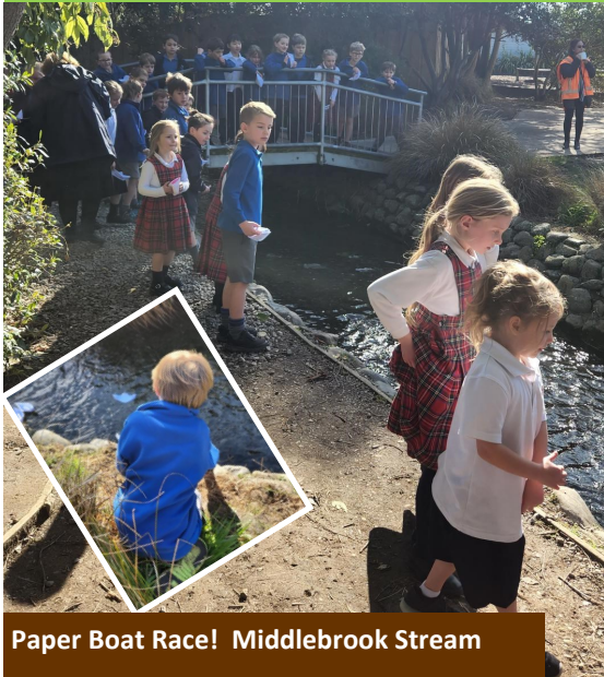
Paper Boat Race! Middlebrook Stream