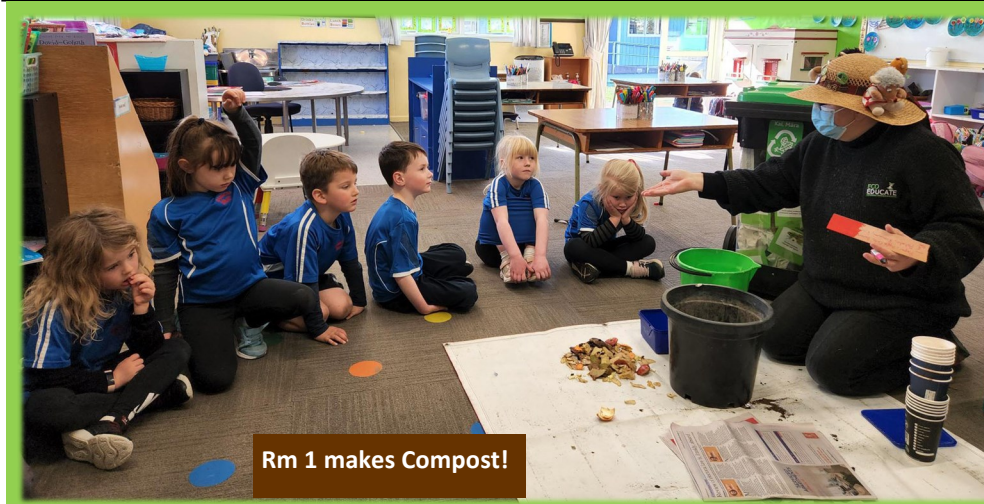
Rm 1 makes Compost!

Reminder: Parents please note that school opens for student access from 8.30 am —ie not beforehand please. We have a duty teacher supervising the Denchs Rd netball court area from 8:30 am to 8:50 am (prior to class entry). RNLS staff cannot supervise children prior to 8:30 am.