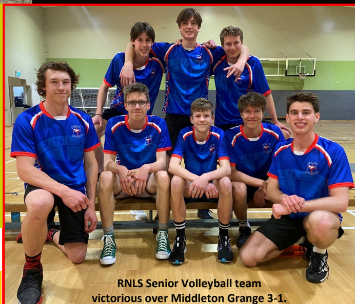
RNLS Senior Volleyball team victorious over Middleton Grange 3-1.

We made bride holders from old shoes. Lyla.