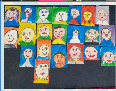
Room 4 2024 Self Portraits